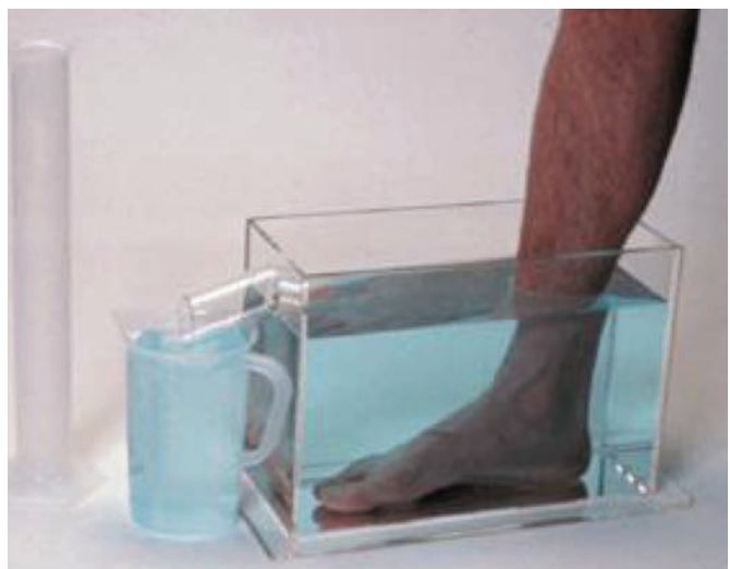
Figure 3. Baseline volumeter measuring device, foot set, 5x13x6 inches.

The mean age was 70 years (range 59 to 85 years) and 14 patients (70%) were women (table 1). Mean body mass index was 33.1 kg/m 2 (range 20.8 to 45.8 kg/m 2 ). The initial physician assessment, based upon the classic clinical assessment, classified 10 patients as having mild edema, 3 as having moderate edema, 3 as having severe edema, and 4 as having no edema (table 1). Edema secondary to venous stasis was the most common edema type, occurring in 50% of all patients with edema. Severity of edema was positively related to the length of time since initial T2DM diagnosis. The median time since initial T2DM diagnosis for patients with no edema was 6 years, compared to 12 and 21 years for patients with moderate and severe edema, respectively.